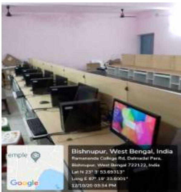
Picture of ICT of Computing Skill Lab